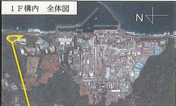
1 F 構内 全体図