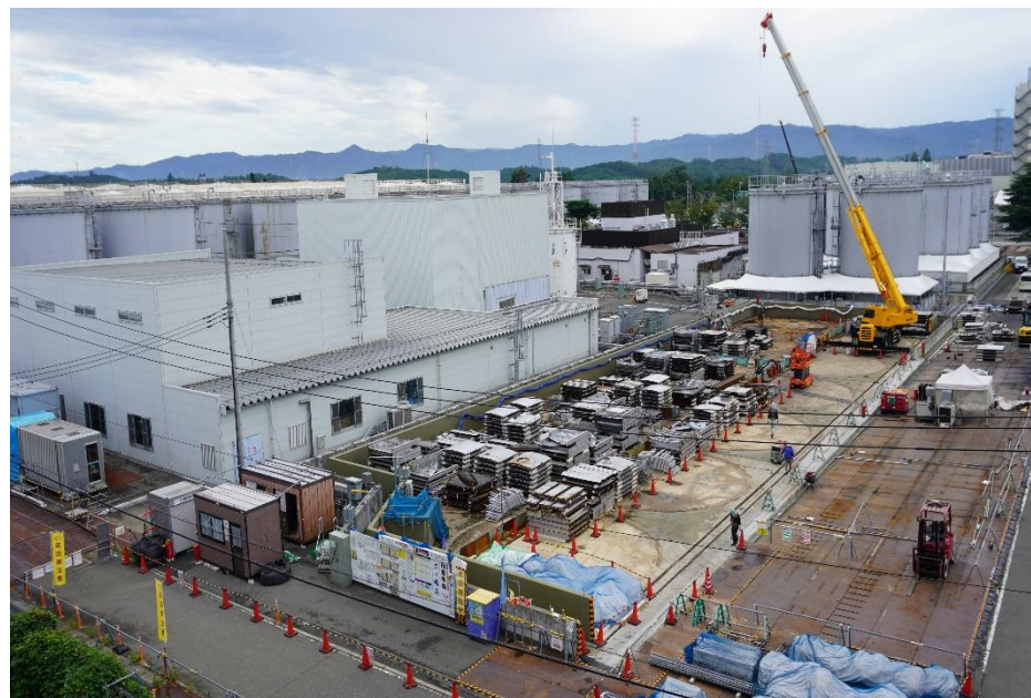
<After dismantling of J9 area>

(Photographed at around 8 : 30 AM on September 3)