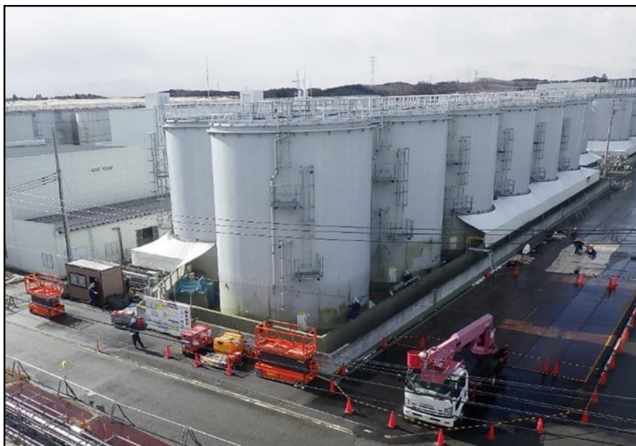
<Prior to dismantling of J9 area>